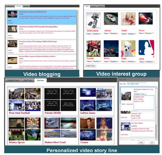
Figure 4. Personalizing video collections tools: video blogging, video group, and video story line.

The MobiSNA system provides several ways to discover a video of interest for the user and personalize a user's video collections, as illustrated in Figure 4.