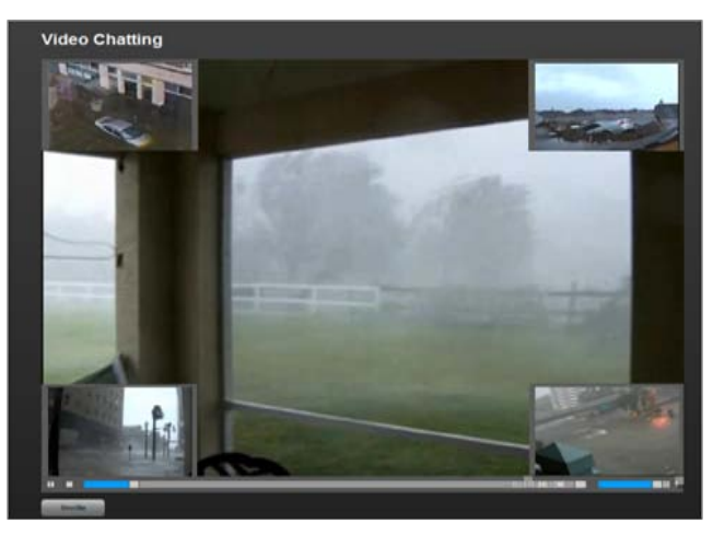
Figure 3. Real-time video sharing for a hurricane.

sharing. Figure 3 shows a scenario where five users are sharing live videos about a hurricane. At the center is a live video from one user and the tour other smaller views are live views from other users. Clicking any of the smaller views will bring it to the forefront.