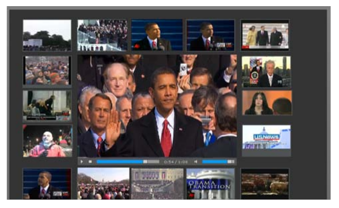
Figure 1. Video exploration for "Obama inauguration".

This feature allows users to browse videos compiled from their social networks. Figure 1 shows the use of this tool by a user who is browsing presidential inauguration videos which she received from her friends.