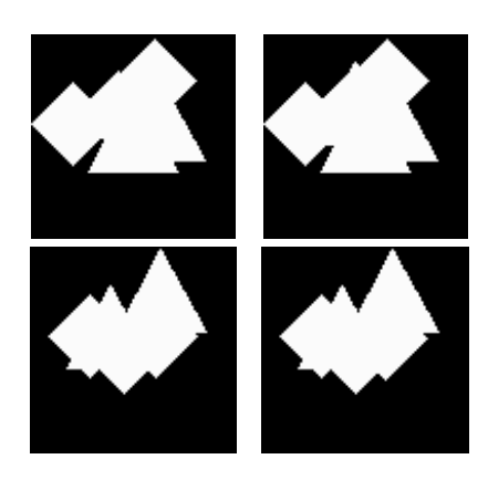
Figure 3: Examples of overlapping data points (left) and machine learnt versions (right)

For the purposes of our experiment, 90 \times 90 sized images of overlapping points were generated randomly using two types, a diamond (A) and triangle (B). Fig. 3 gives typical examples of pixel regions containing overlapping data points and the corresponding machine-learnt version; table 4 details the experimental parameters and results corresponding to fig. 3.