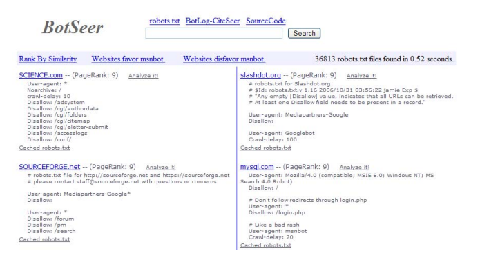
Figure 2. BotSeer robots.txt search component response to query "botname:msnbot".